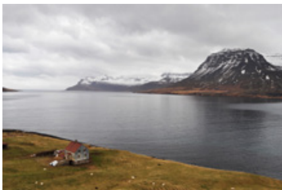
© Christophe Spiesser, Landmark, Sheepfold, Island, 2011.

In opposition to the quick urbanisation of large Nordic cities that keep attracting new dwellers, Christophe Spiesser's pictures display isolated houses lost in the vastness of the Nordic moor, like frail poppies contrasting with the monotony of a wheat field. These images tell us about the relationship between the landscape and the world, other than housing, still present in northern Europe.