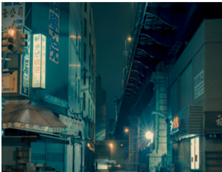
© Franck Bohbot, Enigma, Manhattan Bridge, Chinatown, 2014