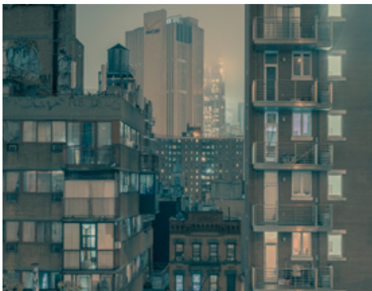
© Franck Bohbot, Windows, Chinatown, 2014