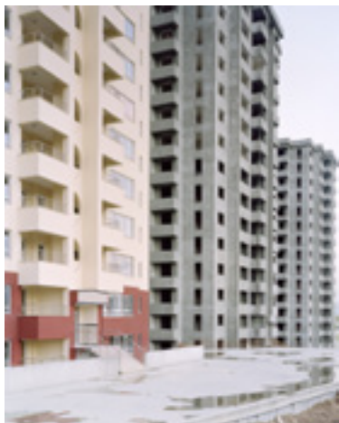
Cover, Sulaymania, 2014

The photographs show houses from various places which are all caught in a permanent process of evolution and transformation. Colour, in its superficiality, plays the role of a protective layer that is added on the original object. It hides the materiality and, at the same time, diverts attention from the actual state of the building and from its substance. The use of colour alone gives the impression that the process of construction or refurbishment is over and increases the attractiveness of every building, which becomes more than a simple living space.