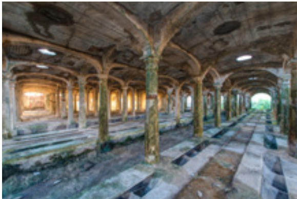
© Sylvain Heraud, The invisible properties , Beersheba IV, Italy, 2014

In the underground Beersheba, the building keep pace with the variations of colours.